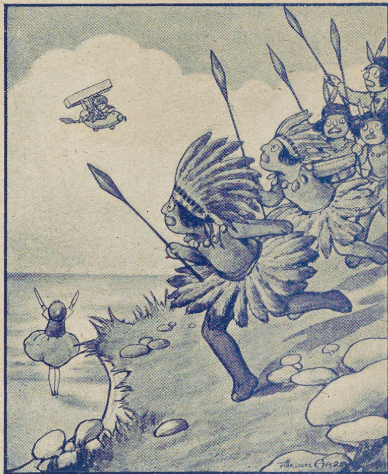
Dutchie ran down to the shore.

The Indians scrambled down the cliffs. The airship dropped lower