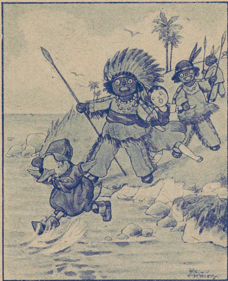
He splashed, dashed into the sea.

maiden you refer to. In her hands we suffered many sorrows, till, one by one, she was careless enough to