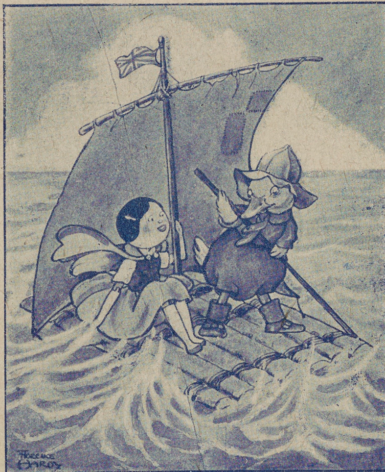
They were alone on the Sea.

But Dutchie would not listen to advice, and a few minutes later they