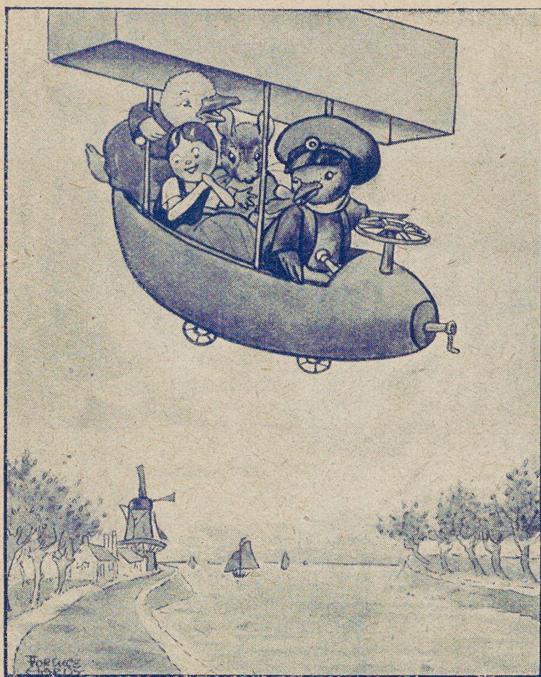
Her joy was great when she saw land once more.

think I ran away from the Indians because I was afraid? Not at all. It was because I knew that that was the only way of saving you. I went all the way home, got my friends, Mr. Bill and Ben Bunny to buy an airship—and—here we are again.”