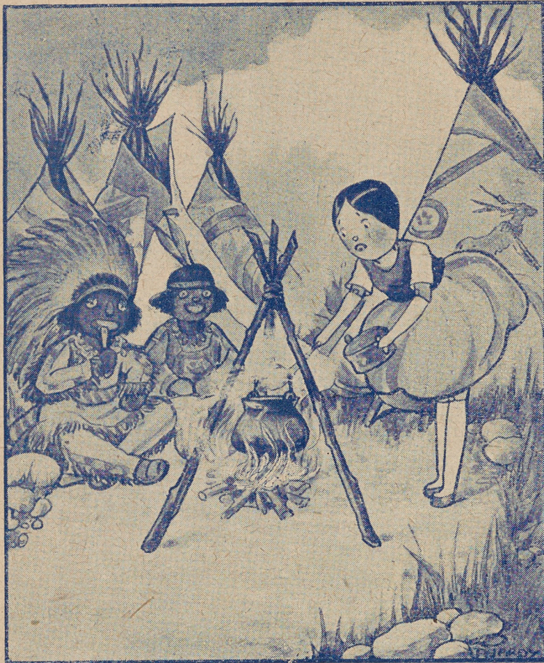
Dutchie found herself hard at work.

reached the Indian camp, where a fire was burning under a cooking pot. A few minutes later, Dutchie found herself hard at work getting food ready while her captors sat round in a ring, telling her to be as quick as she could. It was a hard task, but she had to do it.