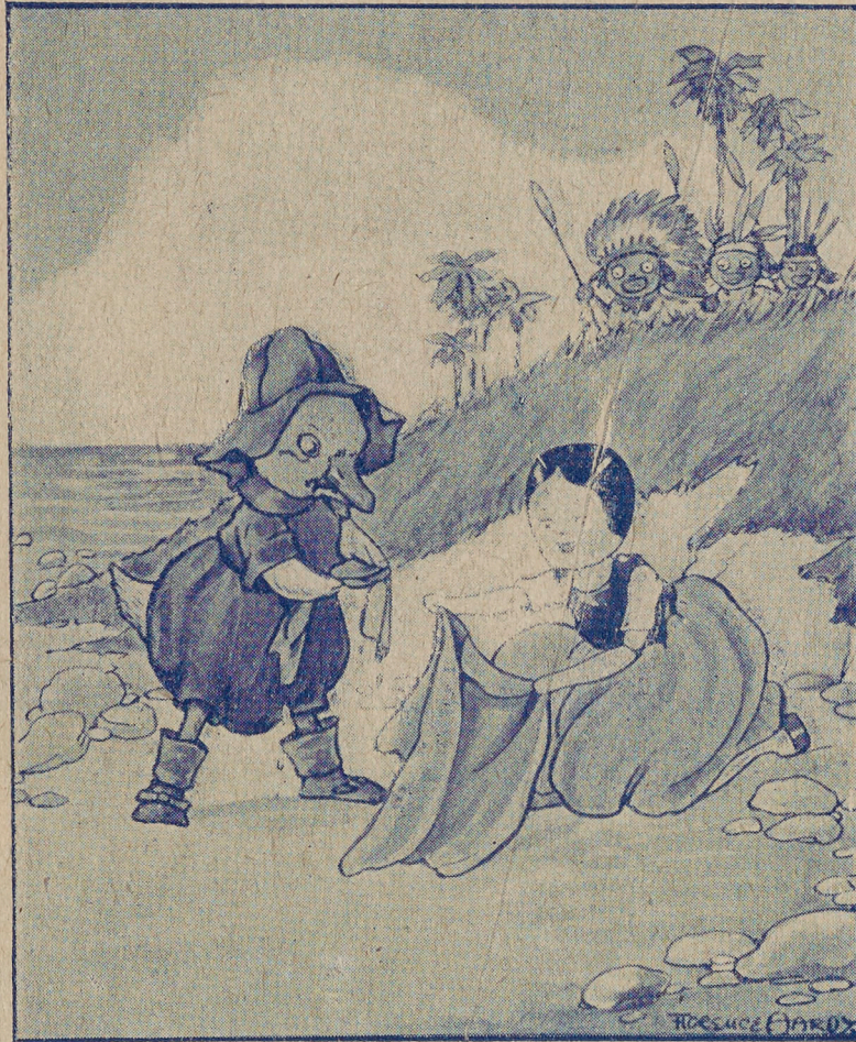
She did not know what was going to happen next.