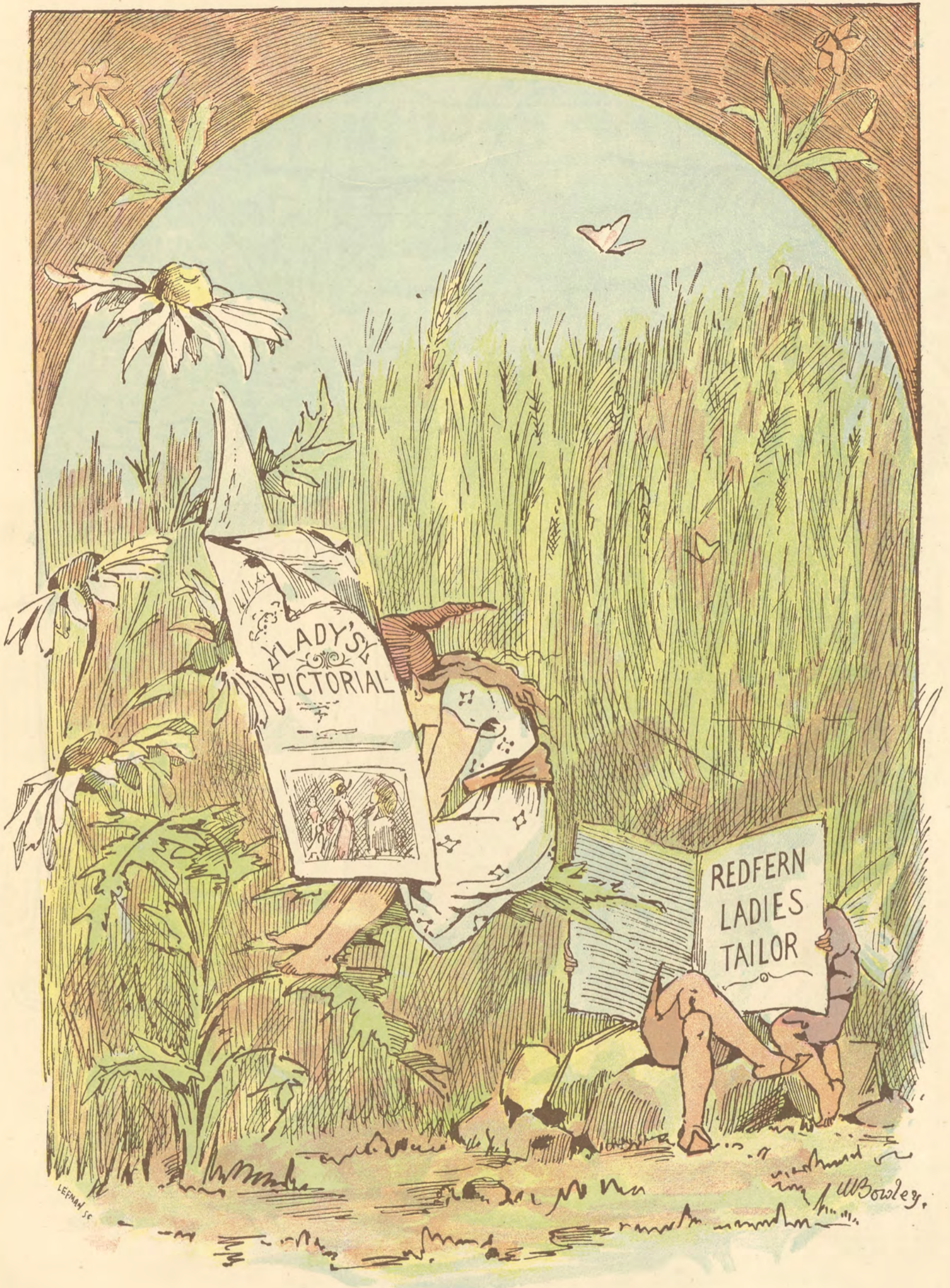
They study the dress of the Mortals.