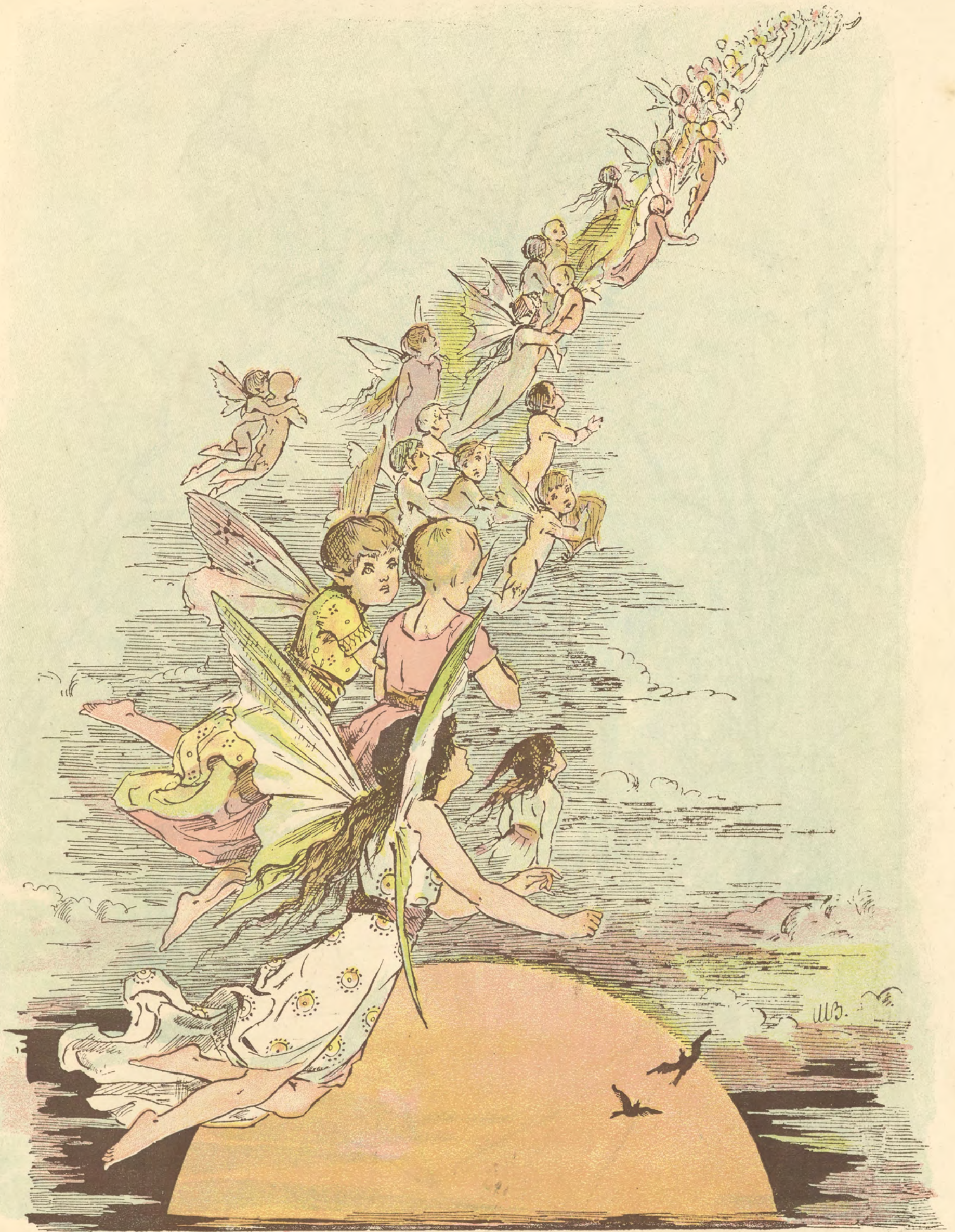
By command of the Queen the Fairies must always return to Fairyland at sunrise.