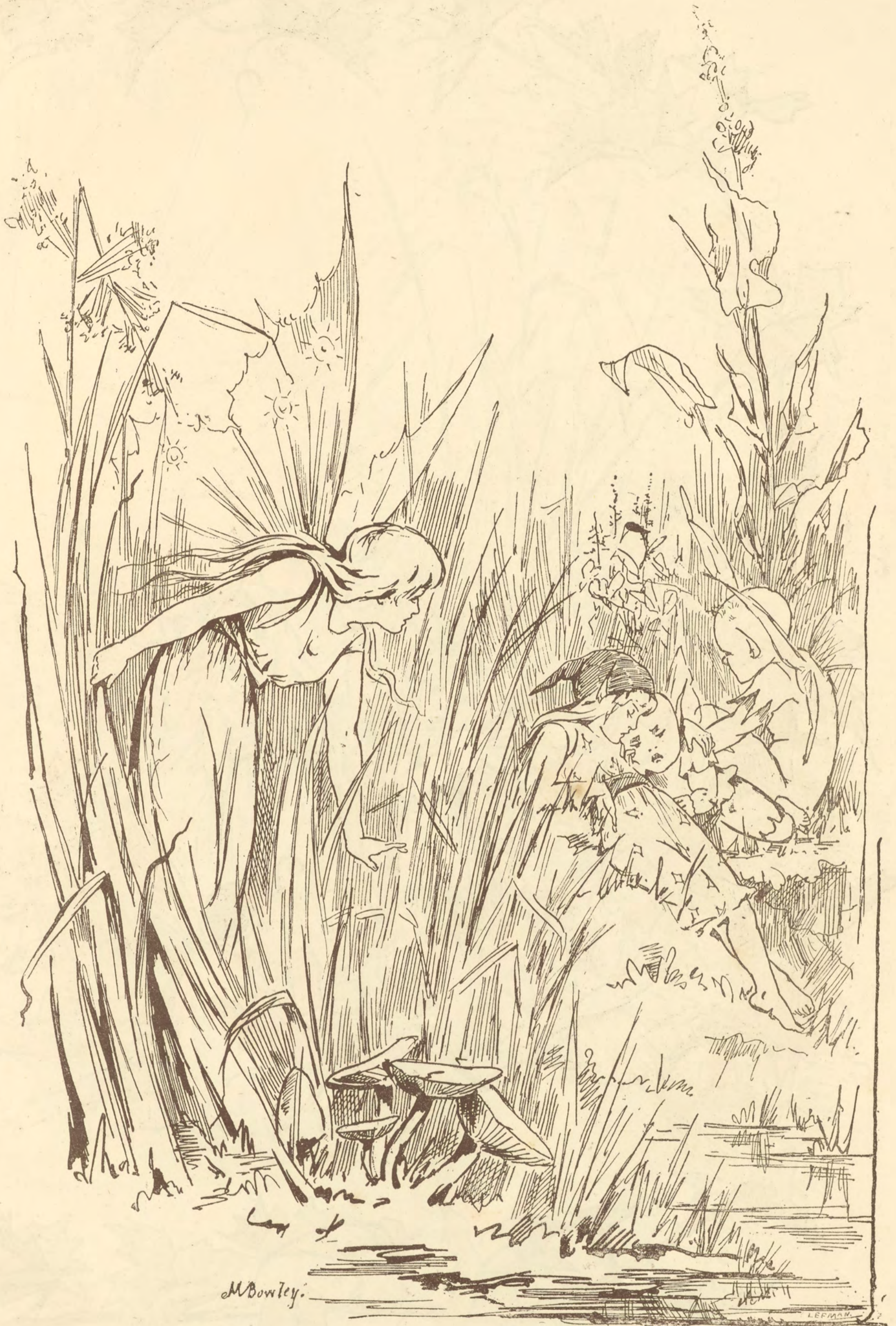
And finds her children at last, three very home-sick Fairies!