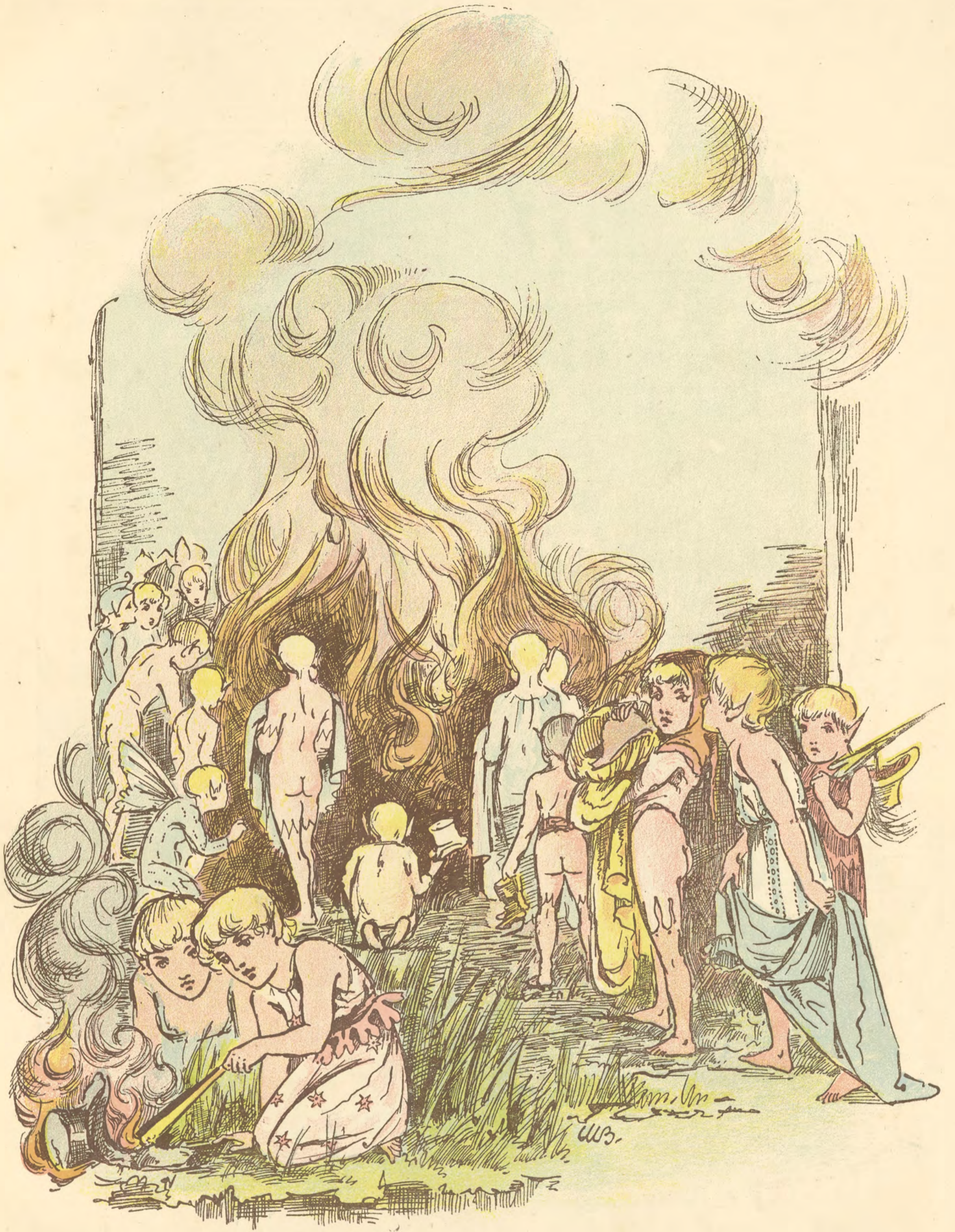
They make a large bonfire, and burn up all their fashionable clothes before starting for home.