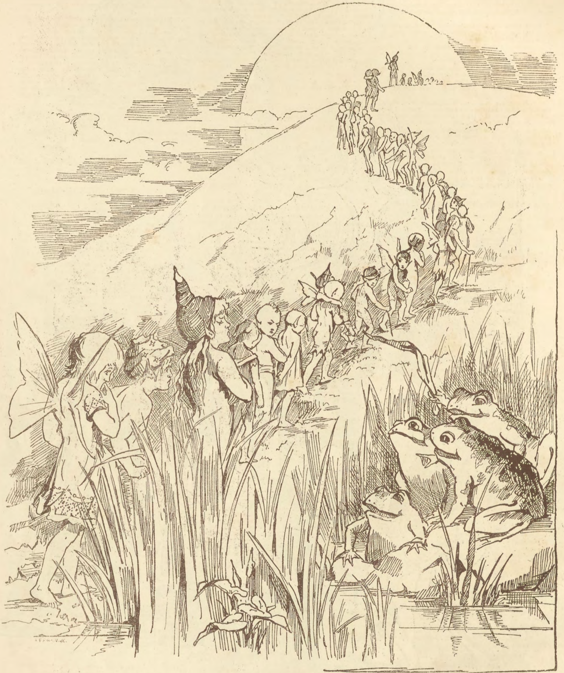
The return home of the sadder yet wiser Fairies. The Frogs come out to laugh and jeer as they march past.