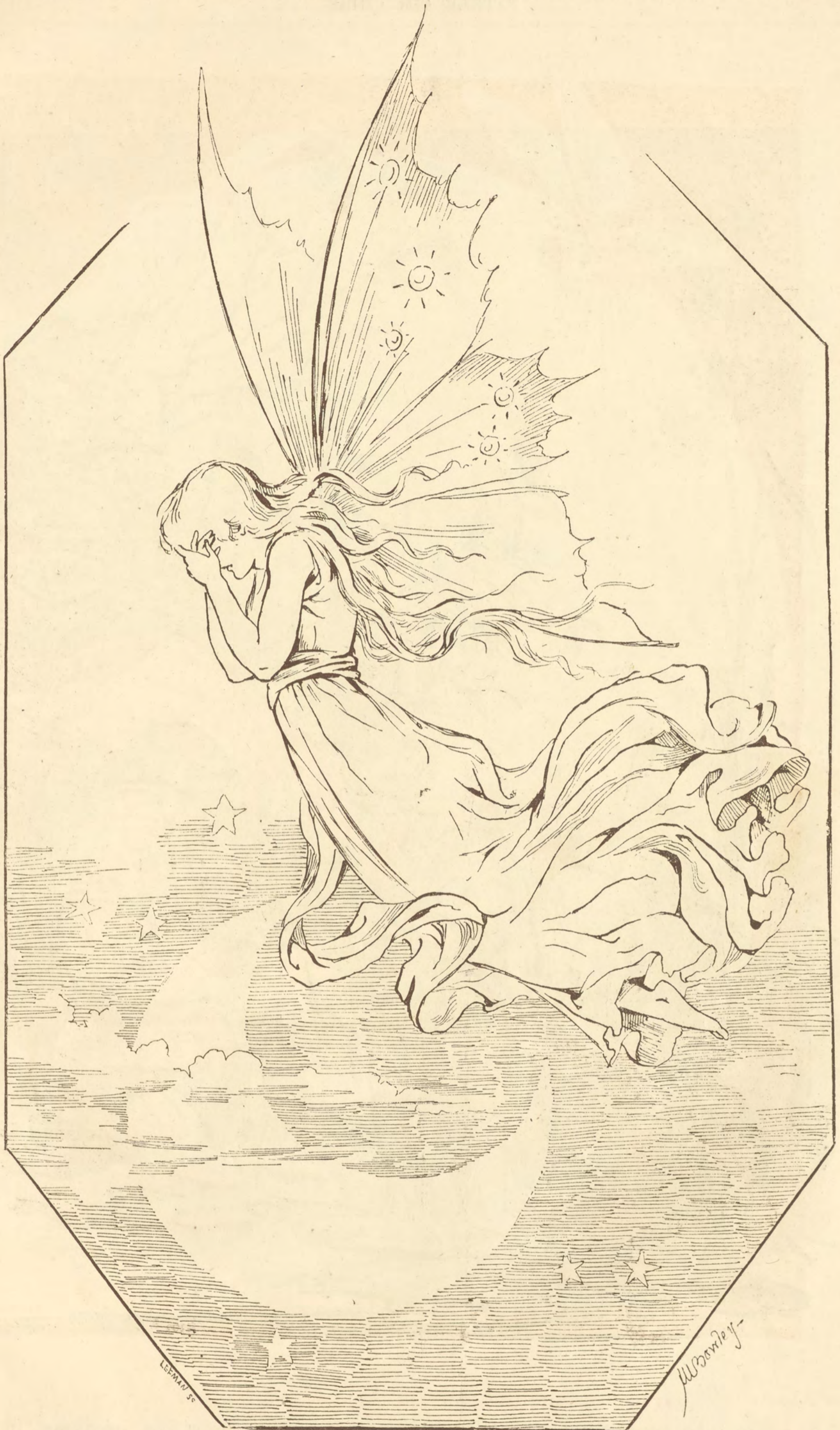
When they do not return to Fairyland their sorrowing Fairy Mother comes down to Earth to find them.