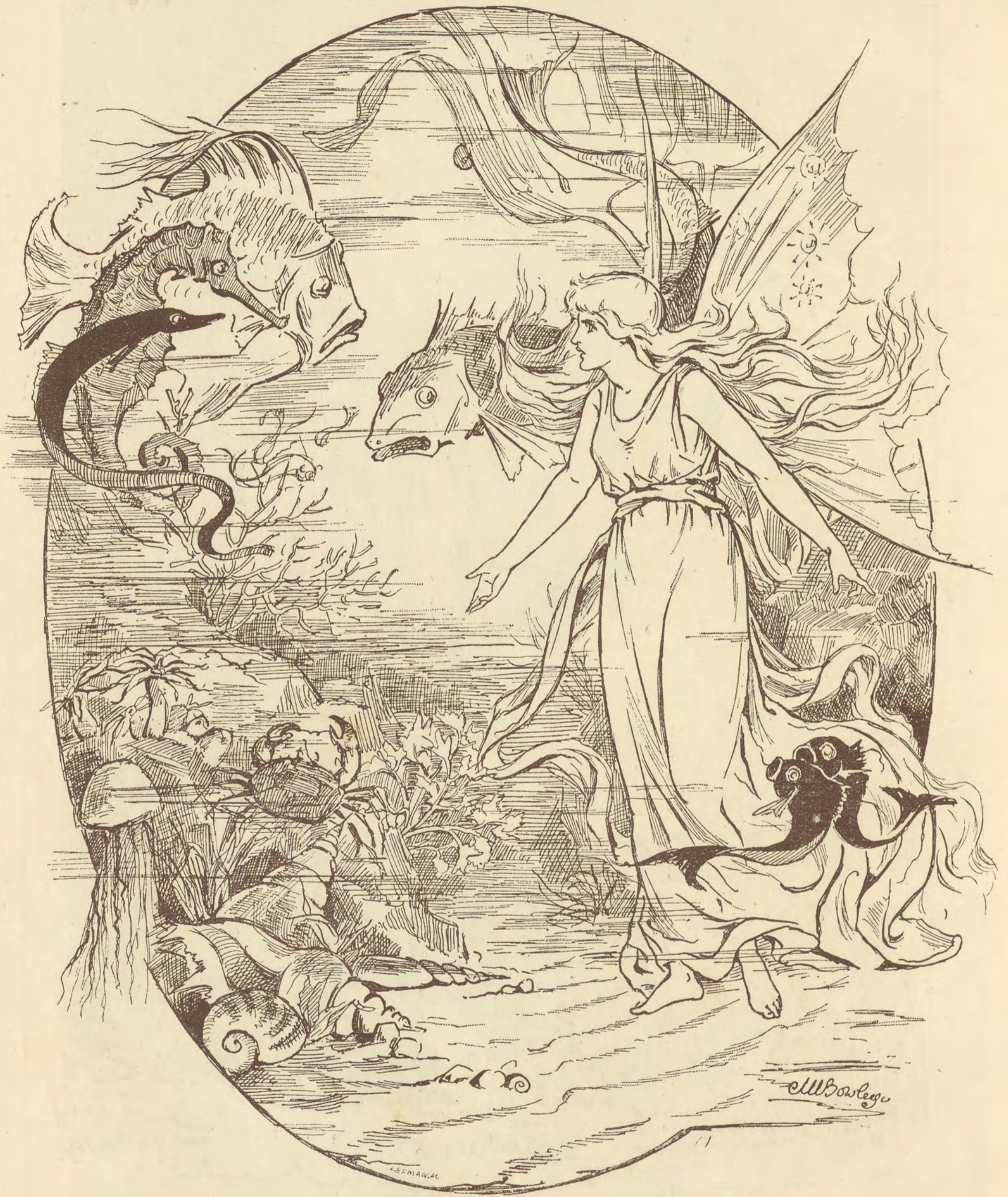
The Fairy Mother makes inquiries under the Sea,