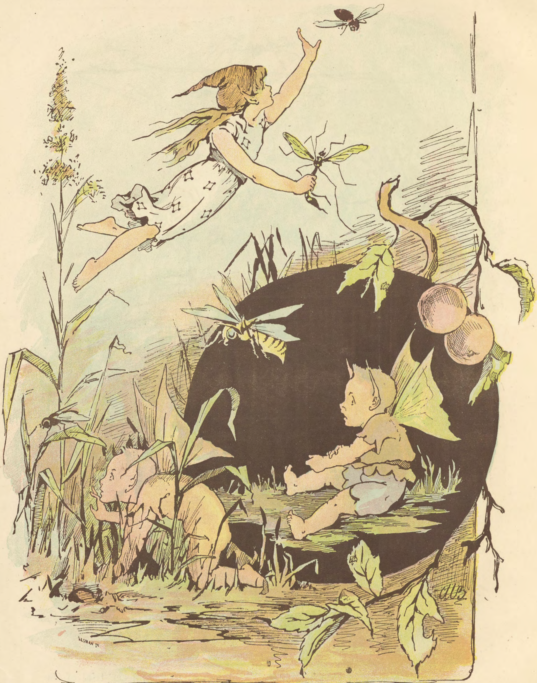
They agree to these terms, and begin to work for the Spider.