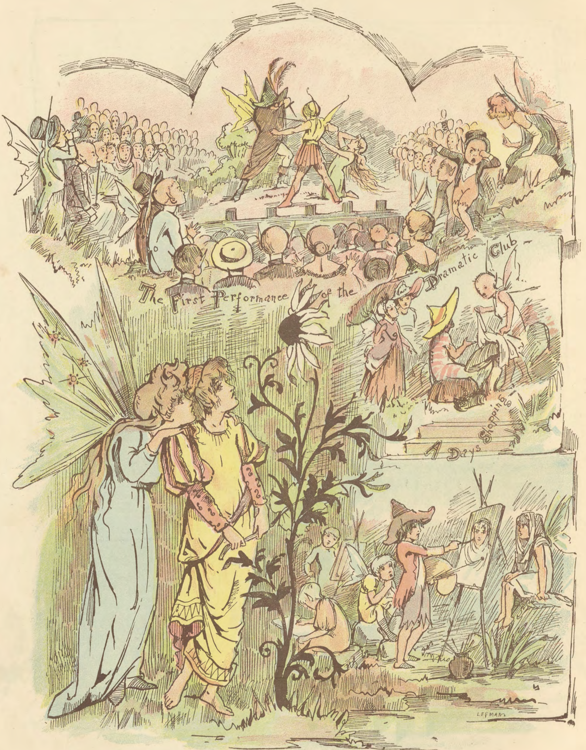
Some of the Fairies develop a taste for art.