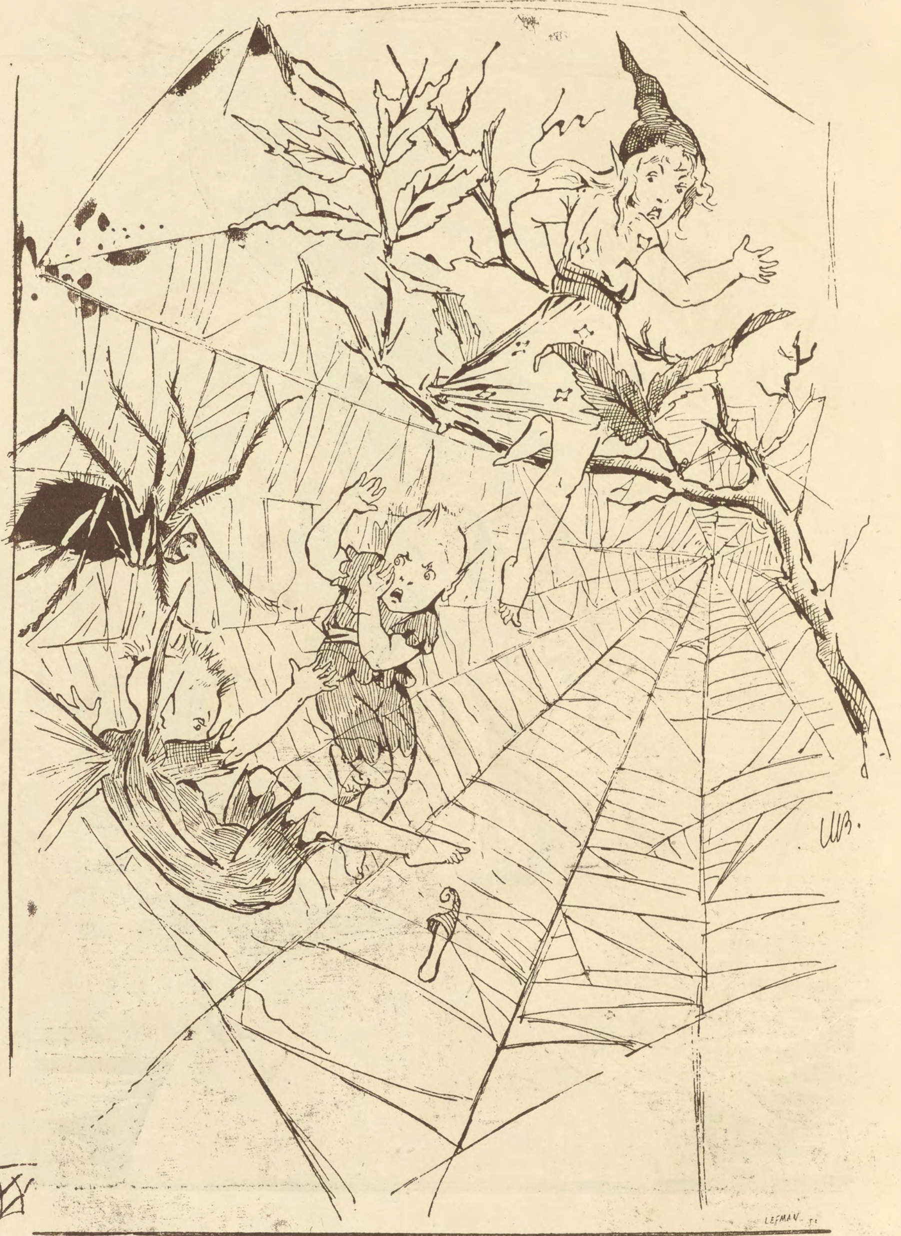
Virtue is not always rewarded, for these three Fairies, who helped the Mouse while hurrying back to Fairyland, are caught in the web of the Spider King.