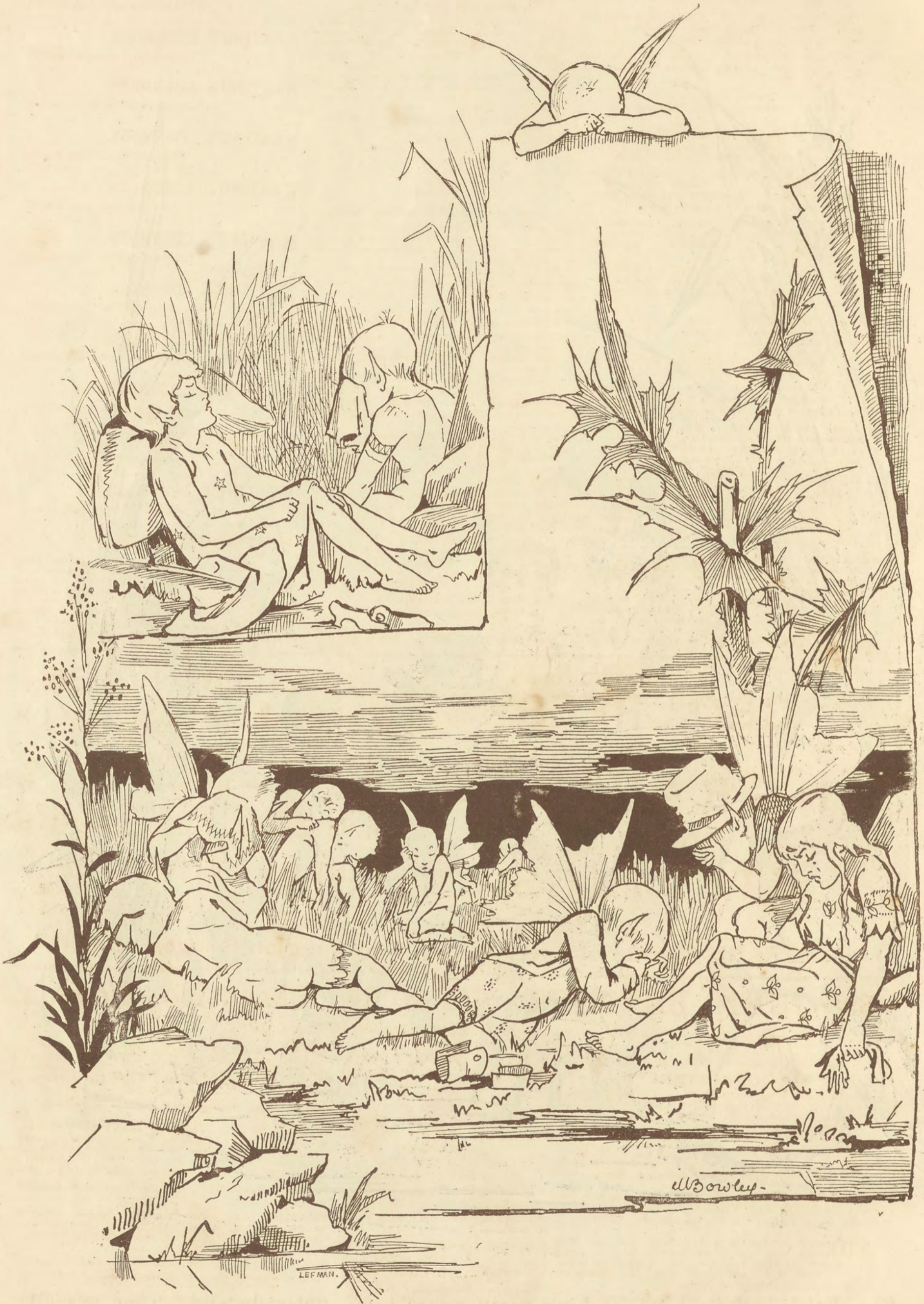
The terrible effect of the dinner party next day.