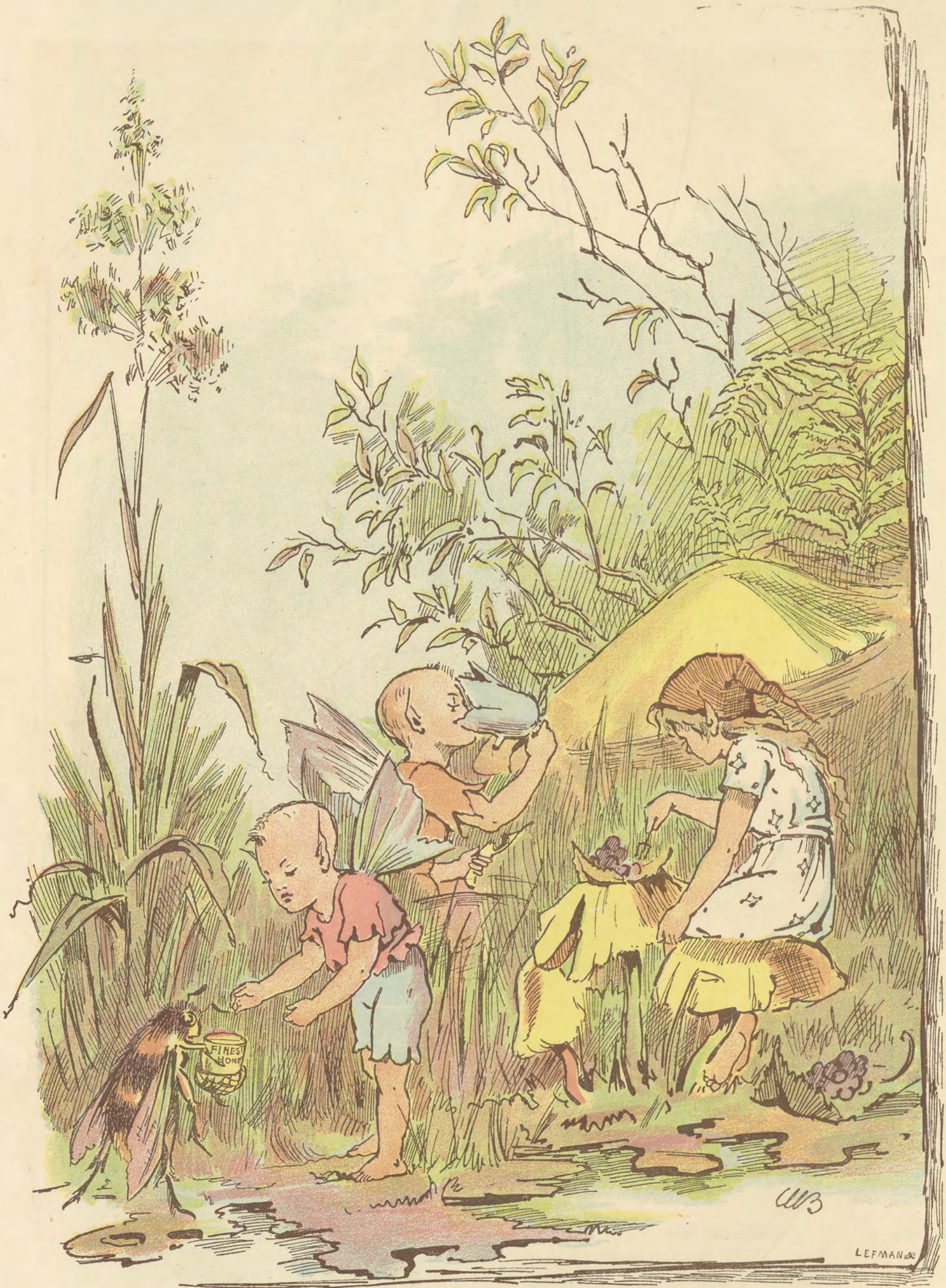
They enter into possession of their new home, and take their first breakfast in it.