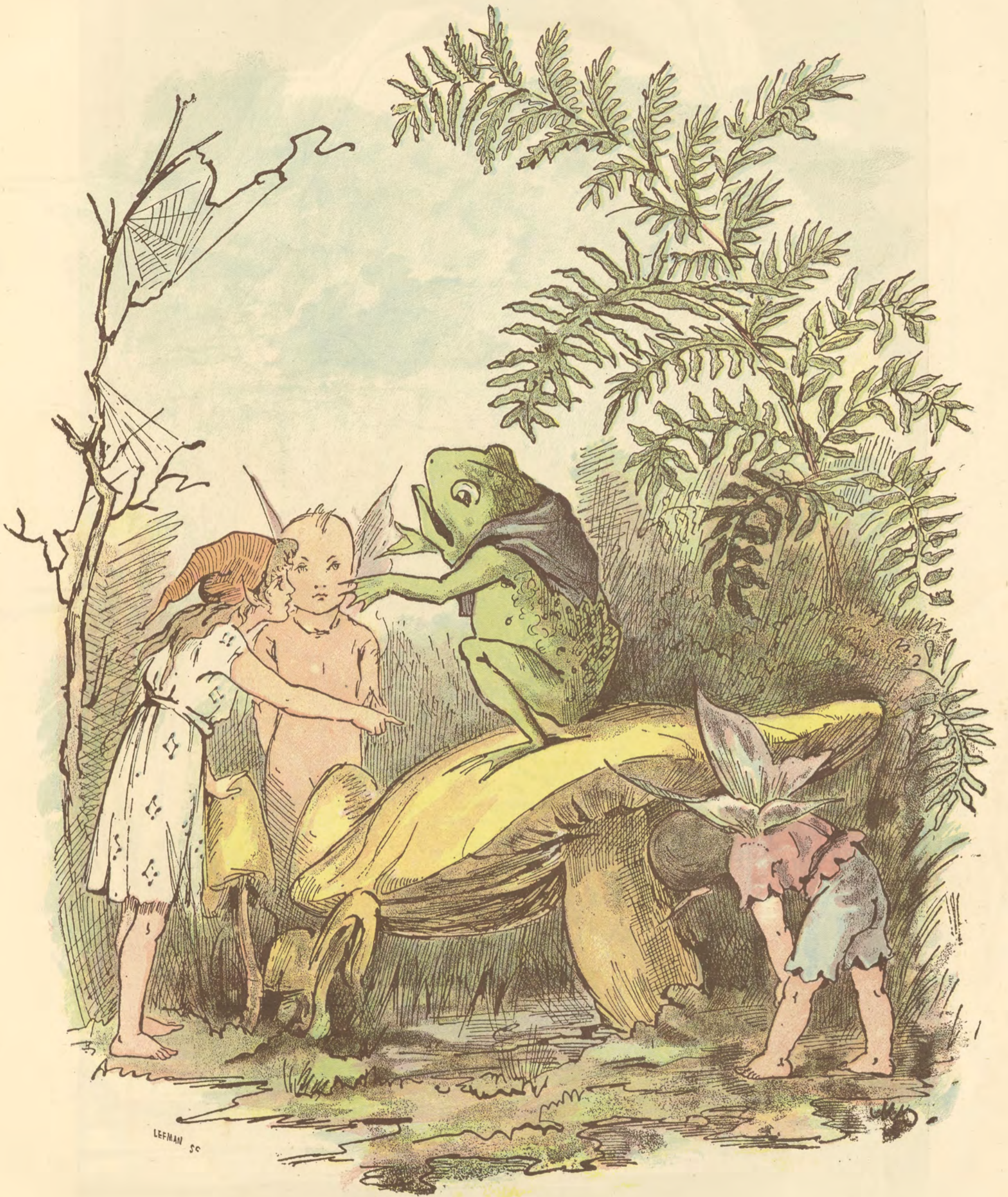
They make arrangements for lodgings.