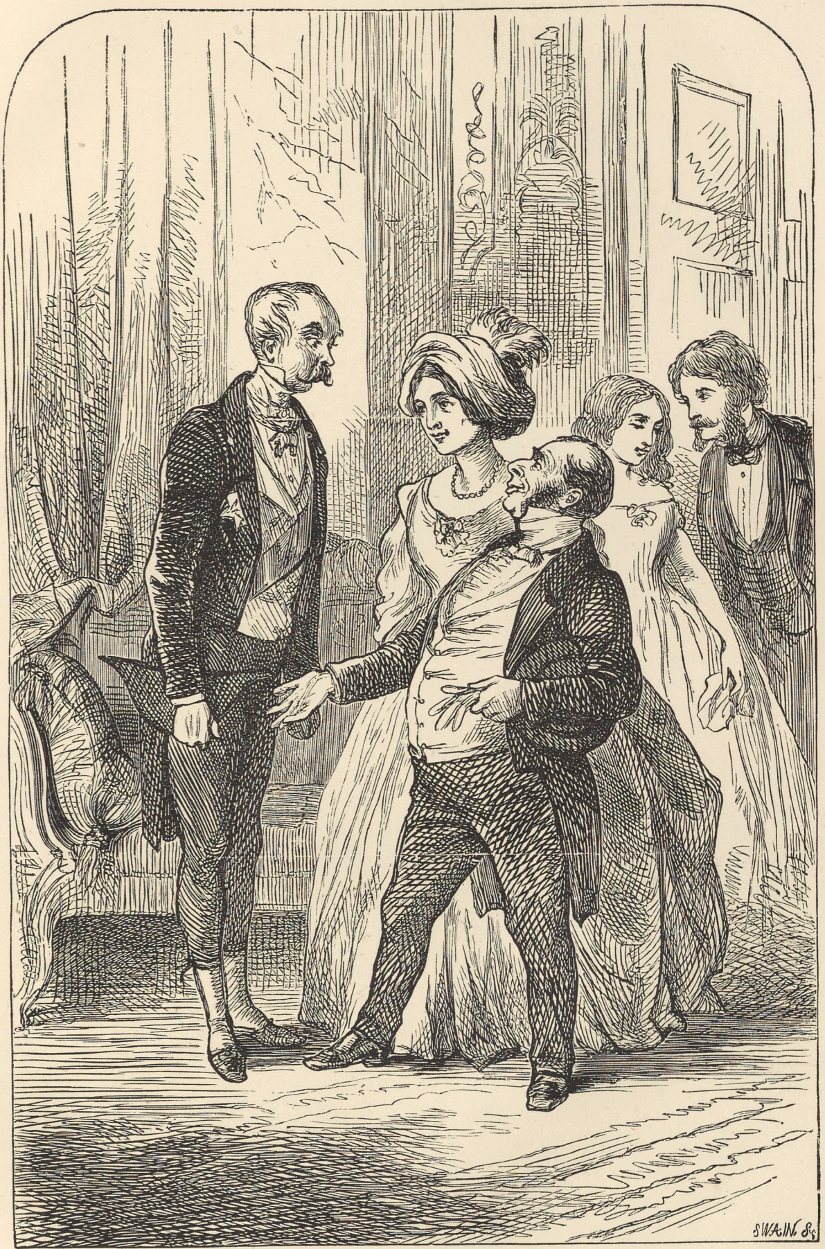
Mr. Frog requests the honour of Prince Ox's company at dinner.